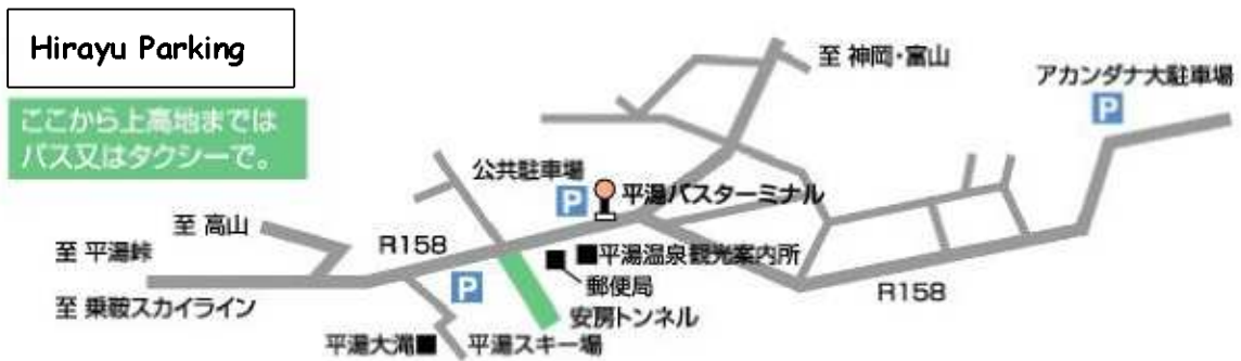
Figure 2 Parking areas in Hirayu